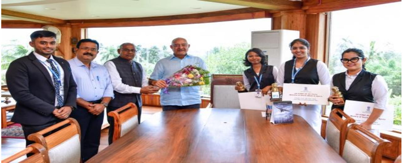
Lieutenant Governor, A & N Islands Admiral Shri. D.K. Joshi Complements ALC Girls represented Islands at Youth Parliament, New Delhi