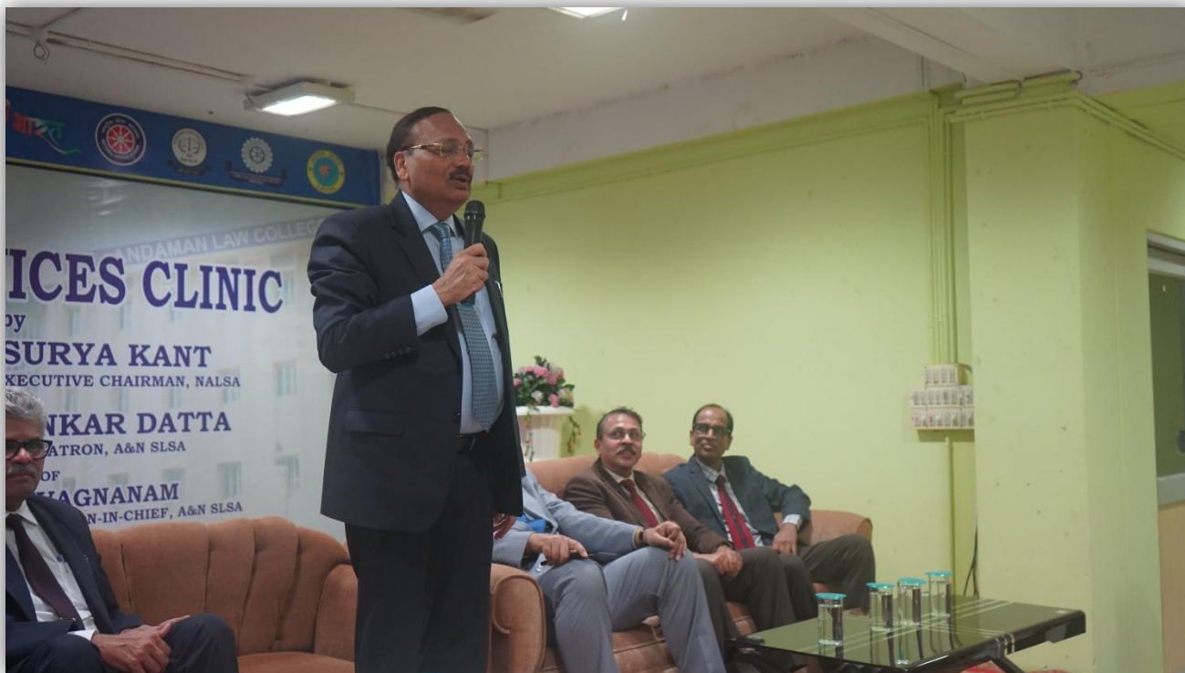
Chief Justice of India, Justice Surya Kant in ALC Moot Court Hall, when he was Judge, Supreme Court of India