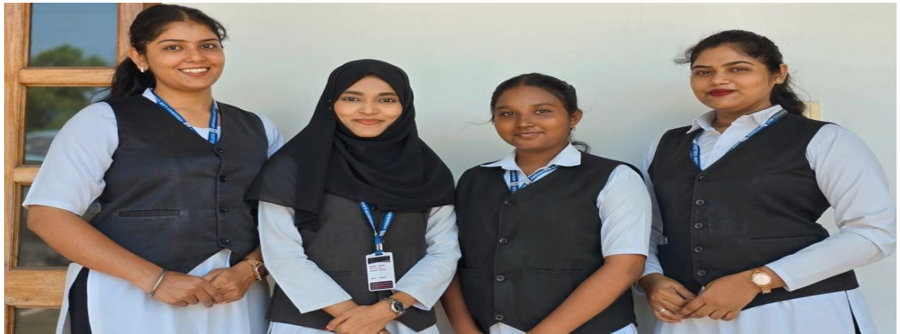
ALC @ National Level Budget Quest, Bhubaneswar -2026