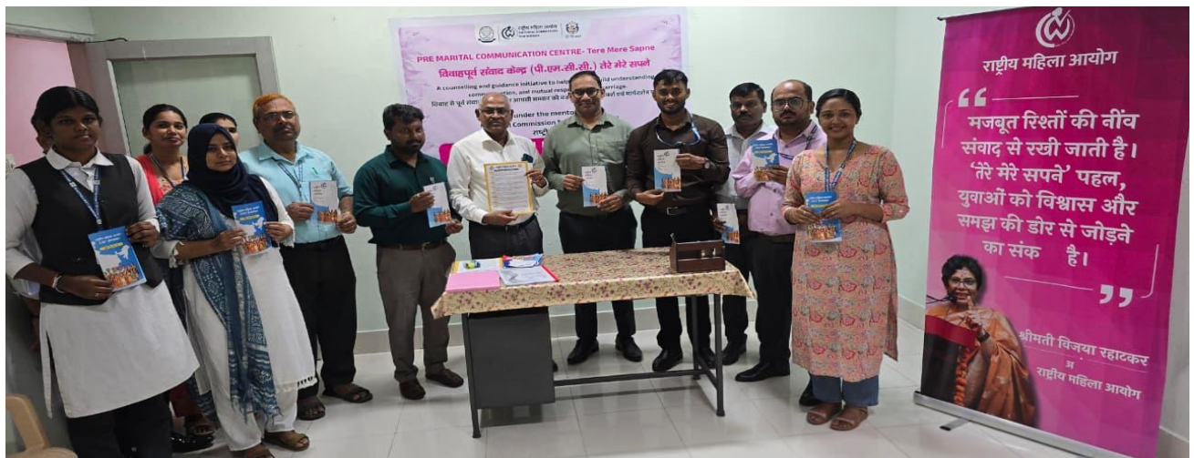
Pre Marital Communication Center, sponsored by the National Commission for Women.